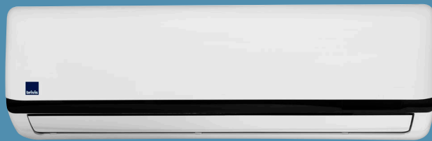
4.2kW & 5.0kW