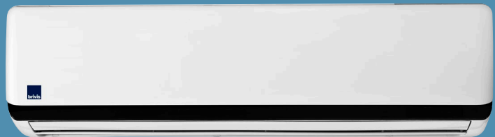
7.0kW & 8.0kW